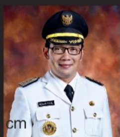
Moch Ridwan Kamil* Mayor of Bandung